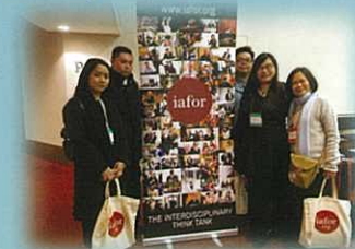
International Psychology Conference in Kobe, Japan

Languages and Writing Communication Religion & Faith Arts & Humanities Wellness Mathematics Scientific Inquiry Community Service