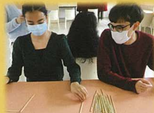
Group Dynamic & Team Building Class Activity

Principles of Sociology Cultural Anthropology Research Method I Religion & Ethnicity in the Modern Society Anatomy & Physiology